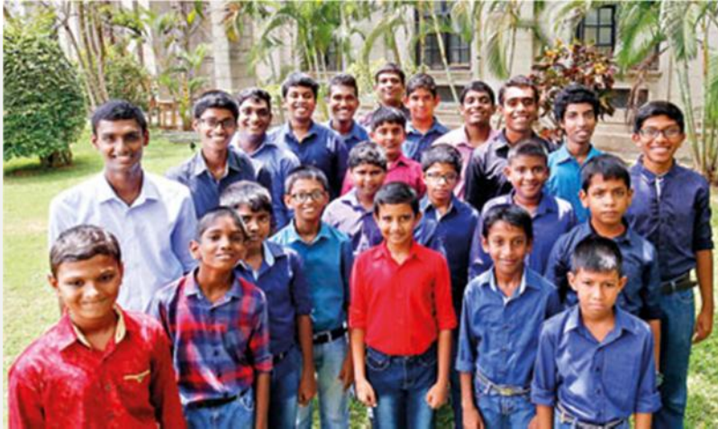
Some of the youngsters who will participate at Musical Perpetua.