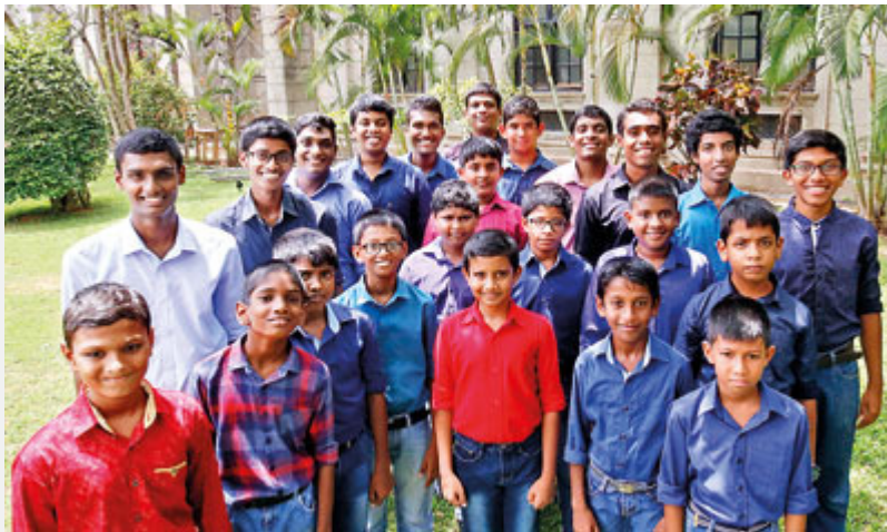
Some of the youngsters who will participate at Musical Perpetua.

trainer and management consultant. He is also the Warden of Lyceum International School, Nugegoda.