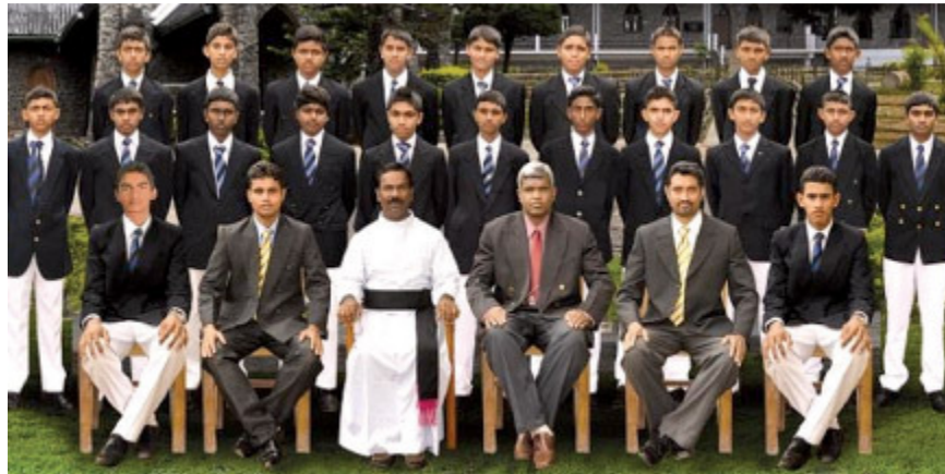
S. Thomas' College, Bandarawela team