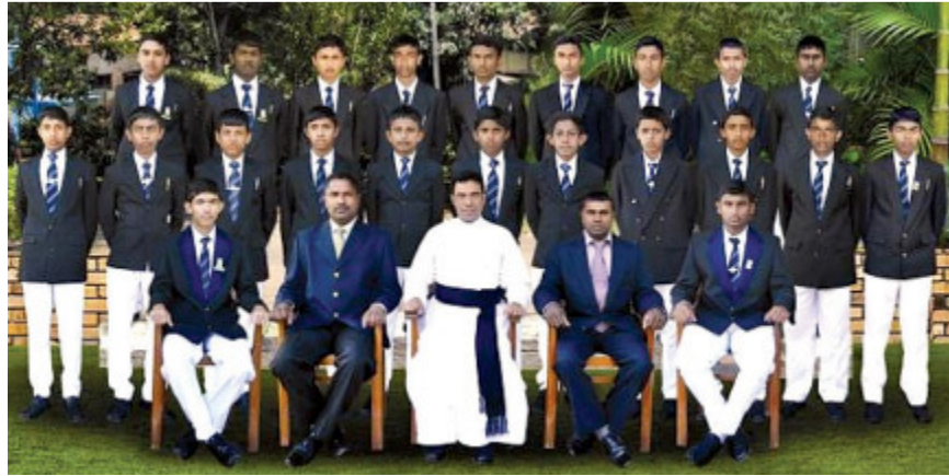
S. Thomas' College Gurutalawa team

The annual Uva Thomian Cricket Encounter 2013 will be held today and tomorrow at Bandarawela Municipal Ground, starting at 9.00 a.m.